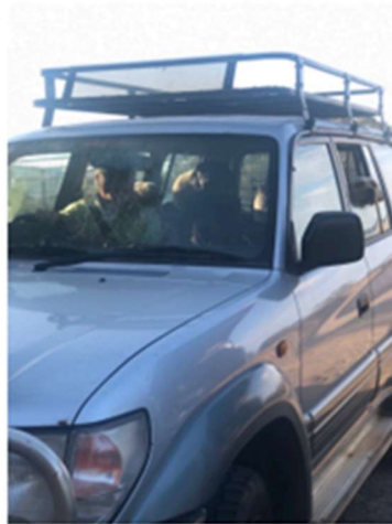
1998 Petrol Toyota Prado GXL