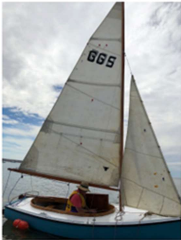
1930's NZ Wooden Mullet Boat and trailer.